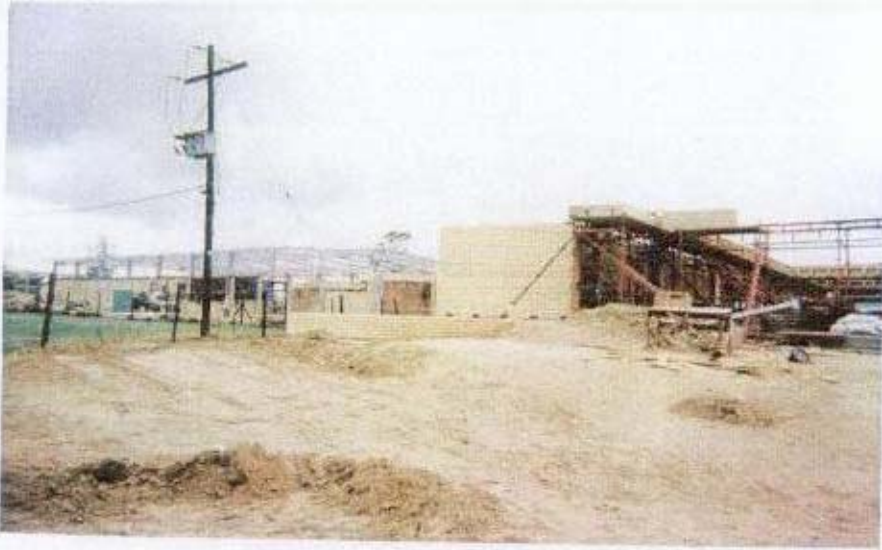
Entrance to the Depot and Library