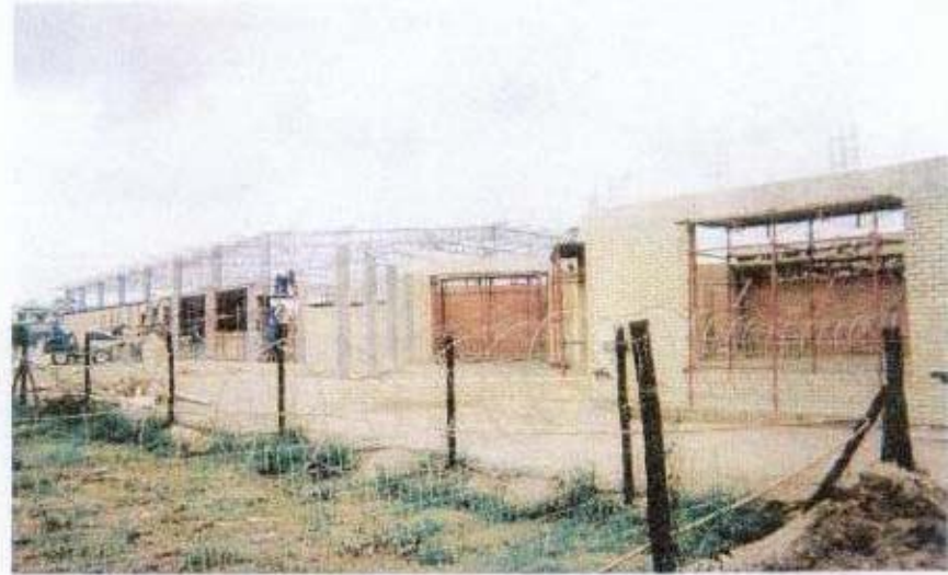
Mbazwana Library and Depot under construction