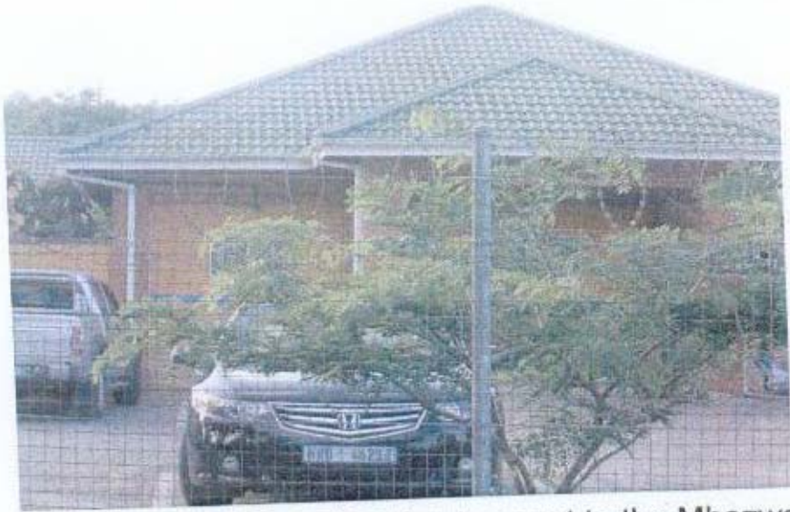
Mbazwana Education Centre: next to the Mbazwana Depot and Library