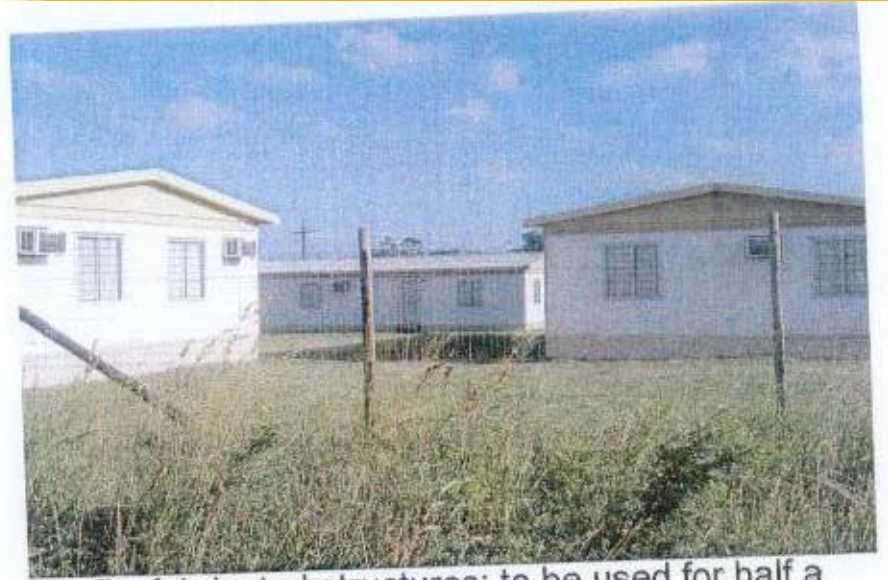
Prefabricated structures: to be used for half a service?